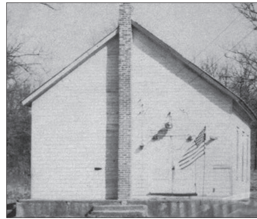
3-Mt. Gibson was located on Highway H on the northwest boundary of Fort Leonard Wood, near where the Missouri Veterans Cemetery is today. There were 15 students in grades 1-6.