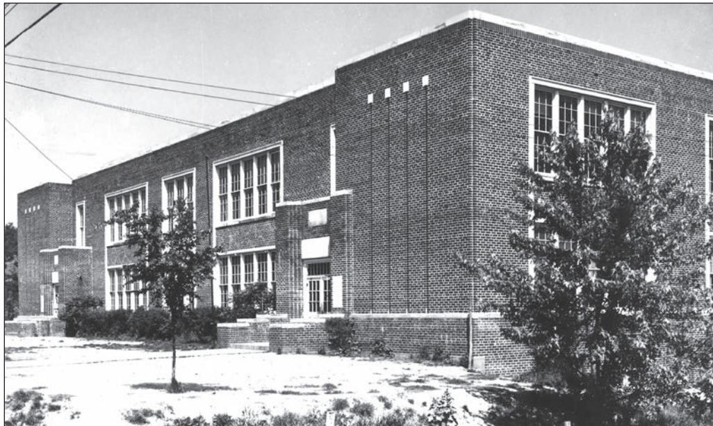
This is the Waynesville school building on North Street in 1950. It is the third school built on this site. The first was a frame building constructed in 1886. It was used until 1906 when a new concrete block building replaced it. It was razed in 1936, and this much larger WPA-assisted modern brick school was built. It even had indoor plumbing and a basement cafeteria, both absent in the old block schoolhouse. It served grades 6-12 until a new high school was built in West Waynesville. It then became a Junior High School (grades 6-9), and then a middle school (grades 6-8). It was razed and the Pulaski County Justice Center erected on the site in 2020.