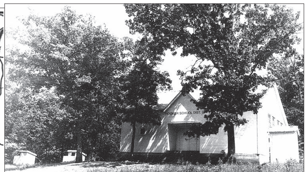
5-Hooker School stood just east of the present Hooker Cemetery on the original graveled Route 66. It was the largest of the rural schools with 29 students and two teachers. It was also noteworthy for having a cook and lunch room. Outhouses are at left in the 1950 picture..