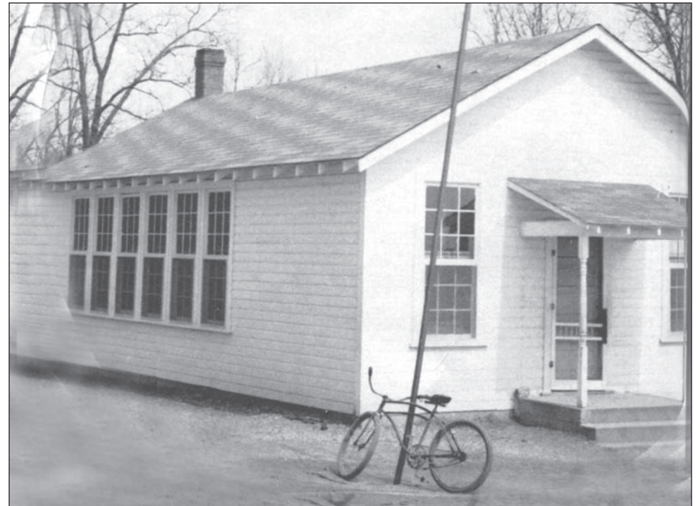
4-Anderson School sat near the junction of Highway 28 and the original Route 66. Anderson hosted a summer normal school in 1906-1907. The school did not have a well so water for the students and teacher was hauled from nearby Bushwhacker Cave Spring. There were 19 students in 1950.