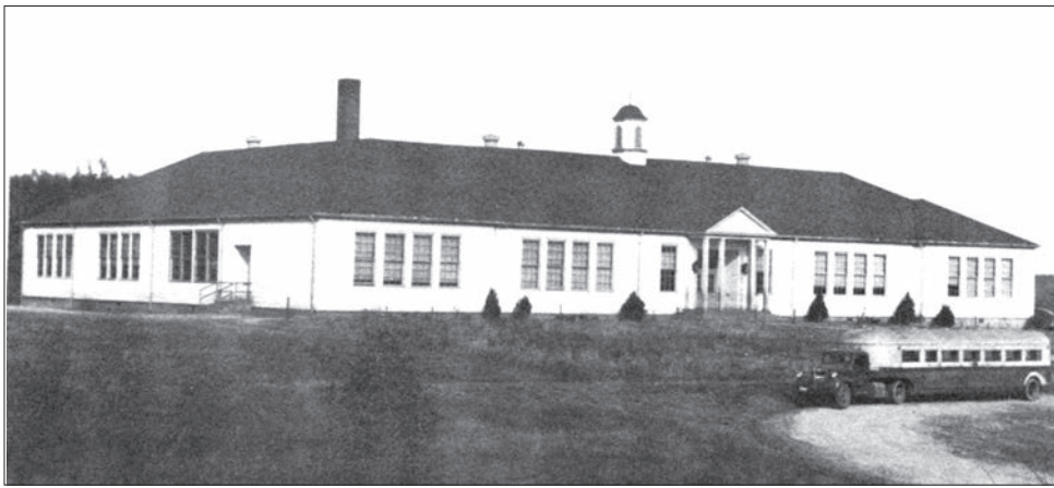
1-Waynesville had two school buildings in 1950. The Junior-High School was on School Street, one block north of the town square and is pictured on the previous page. West Elementary, above, was built in 1942 during the influx of students during World War II. It had 13 classrooms in use at that time. In 1950 it served grades one through five with about 220 students in eight classrooms. The building is still in use today in West Waynesville. It houses the district's administrative offices.